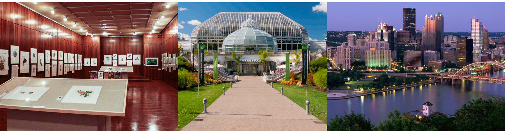
L to R: Gallery vista inside the Hunt Institute; Phipps Conservatory; Pittsburgh skyline at dusk.

Instructor biographies, materials lists, and tour details can be found on the website, www.asba-art.org/conference/2019-pittsburgh .