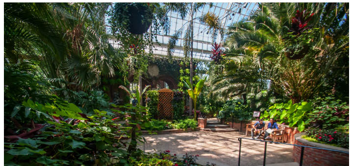
Orchids at the Phipps Conservatory and Botanical Garden

The first 14 members who reserve tables when registering for the conference may sell their botanical art-related products. You can share a table with another artist or a chapter could reserve a table. You are asked to donate 30% of your sales to ASBA.